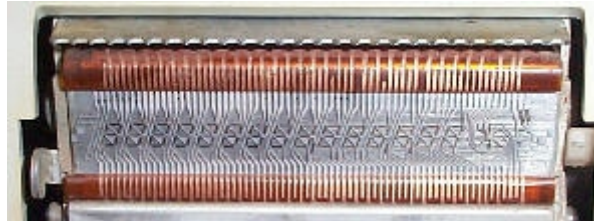
Printing mechanism ^